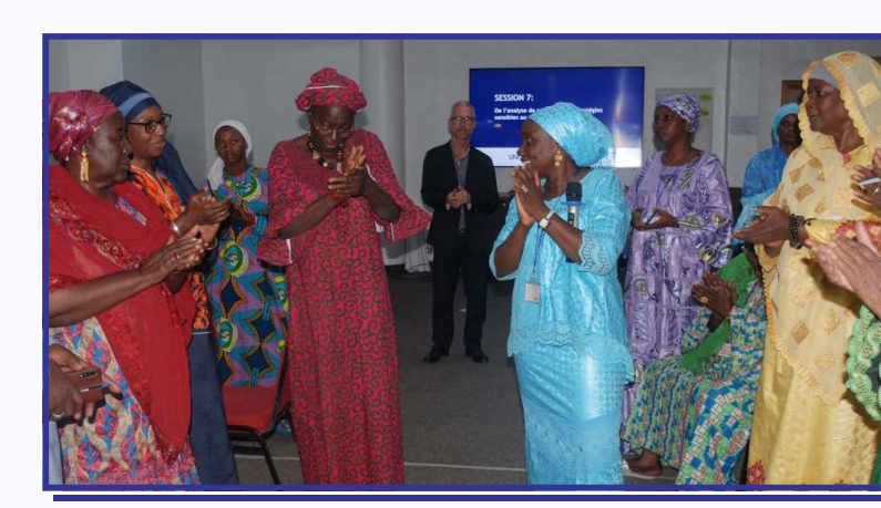
\mbox{MoE} and \mbox{CSO} representatives at the UNGEI workshop on GRESP in Mali. November, 2023

In collaboration with BMZ, GIZ and UNICEF, UNGEI organized a multi-country learning event on Gender-Transformative Leadership and Gender-Responsive Education Sector Planning (GRESP) in Dakar from December 5 to 8. Ministry of Education planners, civil