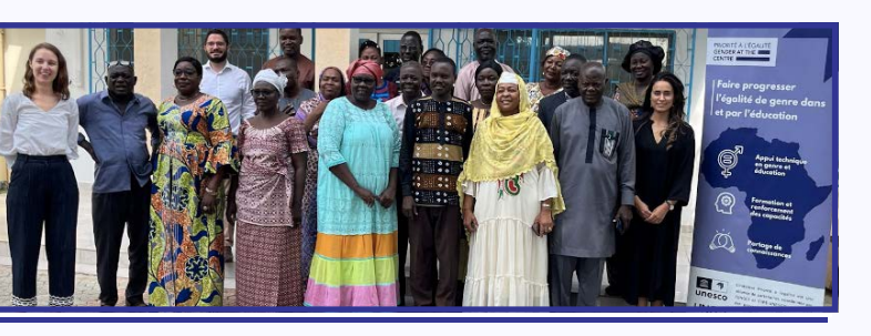
IIPE-UNESCO workshop for the revision of the gender-responsive teacher training manual, Chad, September 2023 \,

In Chad, as part of the "Girls Back to School" project, funded by the Japanese Government (MEXT Project) and coordinated by UNESCO, the Directorate of Girls' Education and Gender Promotion (DDEFPG) of the MENPC worked with the IIPE-UNESCO Africa Office to develop a Teacher's Manual for gender equality in Chad's education system. They also organized training workshops in decentralized administrations. In September 2023, the DDEFPG team and IIPE-UNESCO Africa Office delegation met in N'Djamena to draft the manual and plan upcoming workshops in Bongor and Abéché. Selected decentralized administrations for training during the Bongor workshop included Mayo-Kebi East, Mayo-Kebi West, and Tandjilé. In January 2024, both teams reconvened in Dakar to finalize the manual and organize the Bongor workshop, confirming dates, participants, presentation content, and logistics.