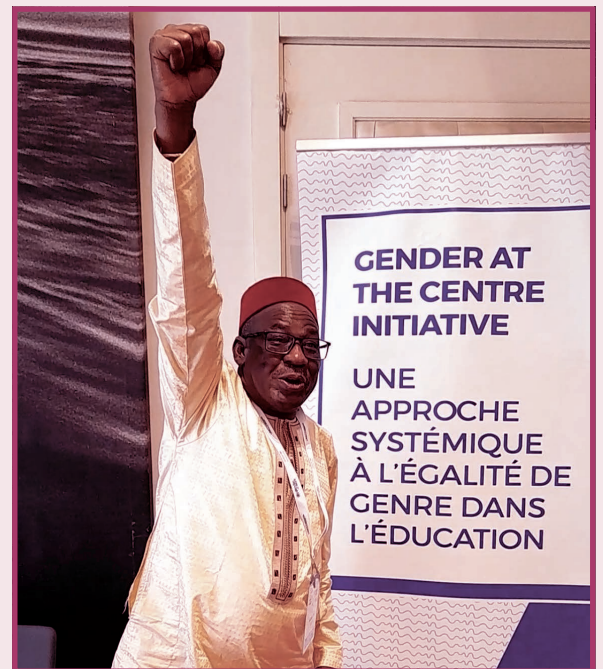
I am a Feminist Leader! - MoE official from Burkina Faso at a regional workshop on Gender-Transformative Leadership