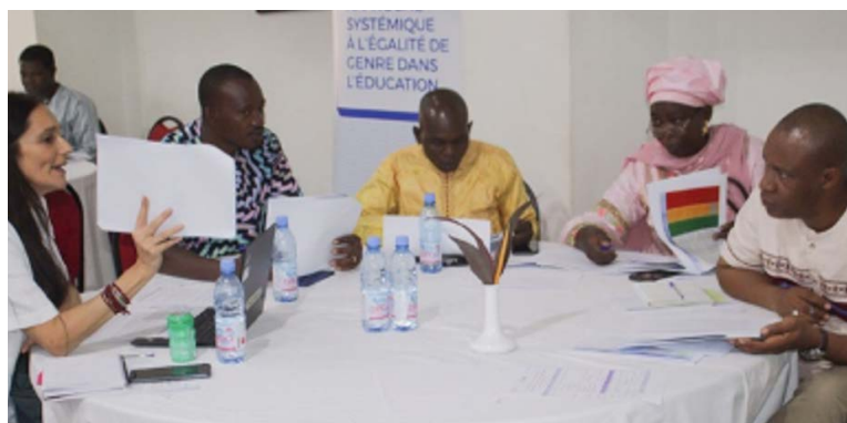
Discussion session on data at the GES workshop in Mali

“In Mali, the disparities between girls and boys increase as the education level progresses, which demonstrates the need to break down the barriers to gender equality in education.”