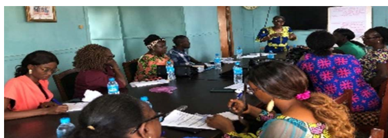
A presentation during the engagement with guidance counselors and focal point teachers in Sierra Leone

“I have moved from the unknown to the known, now I know that teachers have a key role to play to prevent GBV issues in schools and help girls to feel safe and protected in school.”