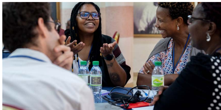
2022 Anglophone edition of the CPGE workshop, Dakar, Senegal, October 2022

With the support of UNGEI and GPE, the Ministers of Education from Niger and Sierra Leone invited South