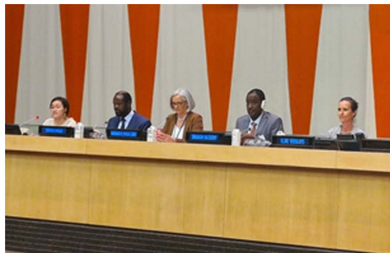
Panel Members at the TES side event on Gender-Transformative Education.

In Chad , the Ministry of National Education and Civic Promotion (MENPC)’s Department for the Development of Girls’ Education and Gender Promotion (DDEFPG) organized - with the technical support of IIEP-UNESCO Dakar- a training and policy dialogue workshop on the integration of gender equality into public education policies from 5 to 8 September 2022. With 48 participants from different departments of the Ministry, as well as from partner organizations and civil society organizations, the workshop made it possible to assess the situation of gender inequalities in education in Chad, and to identify possible actions to address them. The discussions and group work allowed many proposals to emerge and recommendations to be formulated.