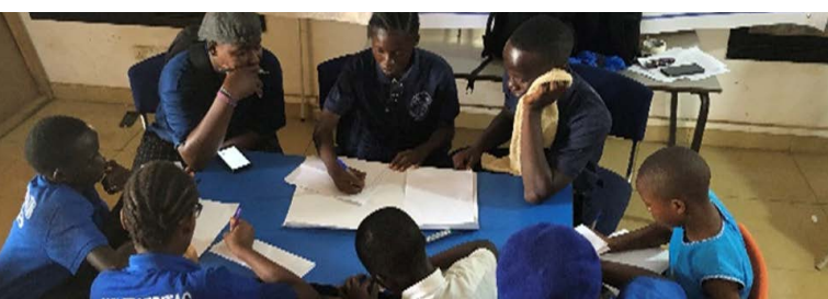
Children Group work on gender norms in Sierra Leone

Sierra Leone: The Education For All (EFA) Sierra Leone coalition, with the support of Plan Sierra Leone, organized a series of activities to promote gender equality in education. From 4 to 8 November 2022 a series of community meetings on gender equality in and through education were held in the Western and Port Loko areas. A total of 148 community members attended, including EFA-SL coalition members and other CSO leaders.