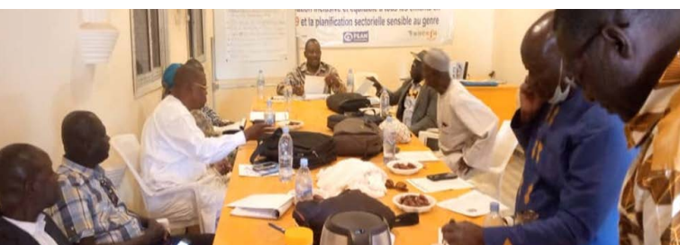
A planning session at COSOCIDE-Chad

Chad: Members of the GCI Chad Consortium, composed by FAWE and the Coalition of Civil Society Organisations for Development in Chad (COSOCIDE-Chad), met for planning sessions on the capacity building workshops to be organized. With technical support and coordination from ANCEFA, the GCI Chad Consortium will organize three capacity building workshops for civil society in January 2023 in N'djamena, Bol and Koumra. The workshops will build capacity on political advocacy for gender equality in education among the leaders of the CSO consortium members, with a specific focus on girls' enrolment and retention in schools, universities and vocational training structures in pilot intervention zones.