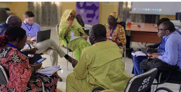
IIEP training on gender-responsive educational planning in N'Djaména, Chad, September 2022

In November 2022, IIEP UNESCO Dakar held a five-day course for 35 education officials from the Ministry of Basic and Senior Secondary Education (MBSSE) and the Ministry of Technical and Higher Education (MTHE) in Sierra Leone . The training, requested by the MBSSE, focused on gender-responsive education planning and statistics and strengthened the capacities of education officers to understand and explain the issues of gender equality in and through education, to identify and analyze the factors that lead to gender disparities in education and understand the links between gender norms and gender disparities in education, and to identify relevant indicators (quantitative and qualitative) and data sources, and be able to use them for analysis.