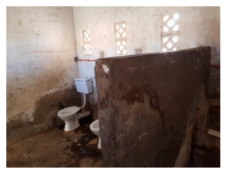
↑ Makhunya Mvulo primary school, Eastern Cape

report a shortage of library materials compared to the survey average of 16%.<sup>86</sup> Many of the shortcomings are in breach of not just the government's international human rights obligations but its own Minimum Norms and Standards for educational facilities.<sup>87</sup>