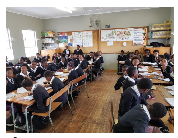
An example of an overcrowded classroom pre-COVID-19. This is the reality in many schools, making it very difficult to adhere to social distance guidelines

home. 103 This reality contrasts with the government's target to ensure 90% of all South Africans can have access to internet access (at a minimum 5mbps) by 2020. 104