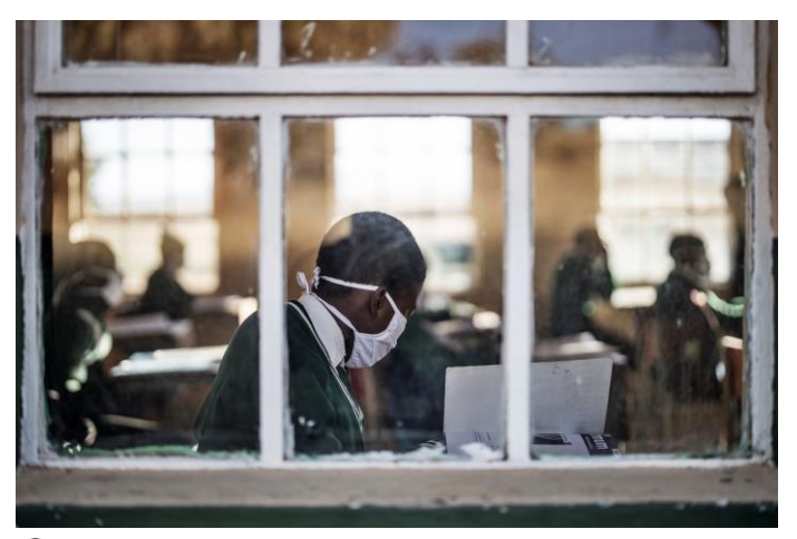
♠ ↑ Grade 7 students sit in their class, 6 July 2020

This section examines the measures taken by the government as part of the COVID-19 response with respect to education. In so doing it assesses the government's response against its human rights obligations to ensure that all learners have the right to access quality education.