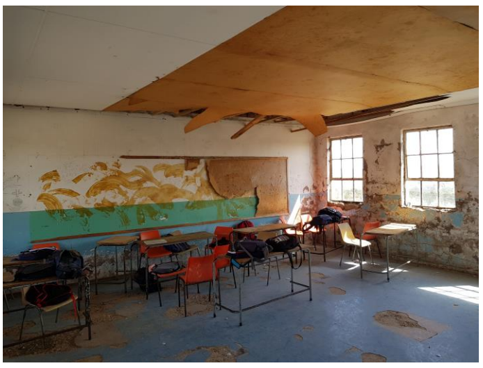
→ July High school, near Peddie, Eastern Cape

preserve hospital capacity.<sup>11</sup> On 1 June the government lifted some of these restrictions including the curfew, the limit on outdoor exercise, the ban on alcohol sales and a partial reopening of schools (see next section).<sup>12</sup> However, on 13 July, President Ramaphosa reinstated the alcohol ban and a curfew in an attempt to free-up hospital beds occupied by those suffering alcohol-related traumas.<sup>13</sup> In the wake of declining infection rates, and recognizing an increasing socioeconomic toll, the Government loosened restrictions again on 17 August with nearly all constraints on economic activity lifted across most industries, including the sale of alcohol. However, as of 29 November 2020 alert level 1 lockdown<sup>14</sup> had been extended to 15 December 2020.<sup>15</sup> On 28<sup>th</sup> December, in the wake of surging cases with a new more infectious variant (501 V.2) and the South African Medical Association warning that the health system was on the verge of being overwhelmed, the President announced that the alcohol ban would be reintroduced, together with the extension of the night time curfew by four hours from 9pm to 6am.<sup>16</sup> Some have questioned the impact of the lockdown on reducing the number of COVID-19 cases in the country and that some measures might have actually had the opposite effect, although this remains a matter of scientific debate.<sup>17</sup>