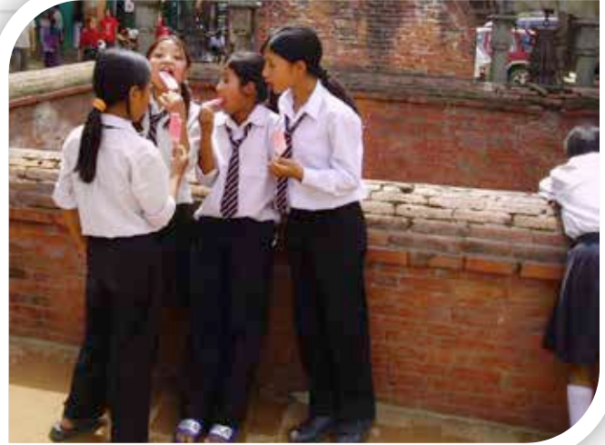
Above: Nepal, school girls