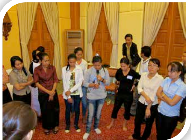
Above: Cambodia, group discussion and sharing.

Embarrassment is not the only barrier reported by mothers. Many mothers indicate that – even if they