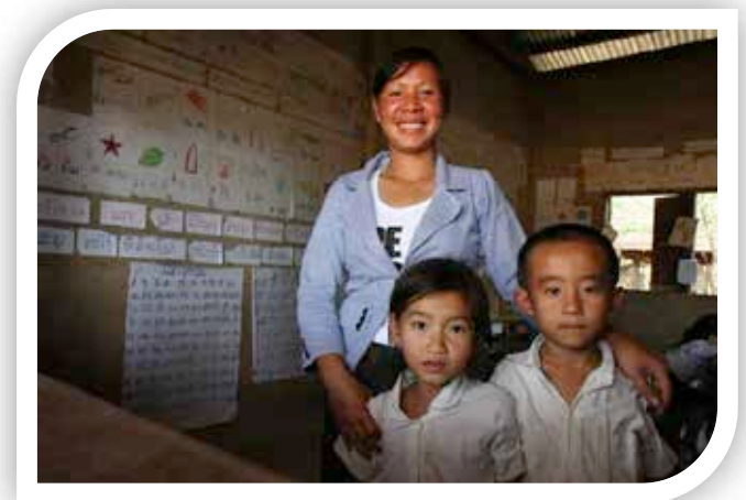
Above: Lao PDR, primary school.