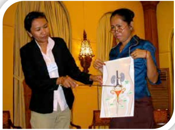
Above: Cambodia, participants talk about the female body's reproductive system.

In response to several requests, the programme has been adapted to include low-literacy options so that it is accessible to participants from a range of educational backgrounds. Whenever an activity requires reading or writing, the manual provides a 'low literacy' alternative.