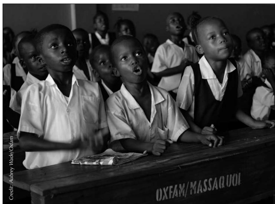
The education experience of many boys and girls in Liberia is improving. Oxfam has helped provide new school benches and uniforms made by local craftspeople.

We see all of these interventions as critical to leadership and employment opportunities for both men and women in Liberia. Education is the key to the social-economic growth for any people or nation, because an enlightened mind can never be enslaved. My country is recovering from an ugly past and is faced with a challenging present. However, thanks to positive leadership and a commitment by both men and women to support education for girls and boys, I believe that it has a hopeful future.