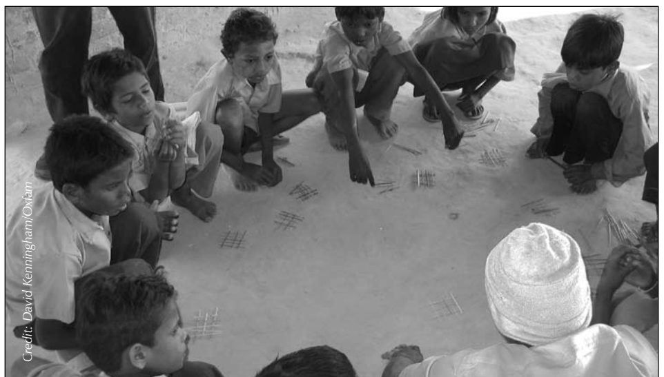
Boys and girls engage in small group learning in India. Initiatives such as SLP help to develop a more democratic and cooperative approach to learning.