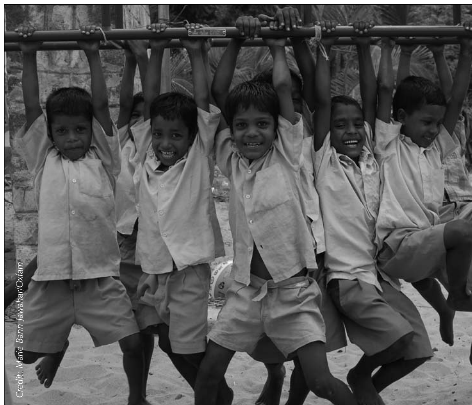
A group of school boys at play in India.

In 2008, UNESCO estimates that 72 million children worldwide are still out of school. Of these, 57% are girls. Globally, boys still enjoy a privileged position in terms of access to education, and for every 100 literate men there are still only 84 literate women. On average, once they have left school, boys and the men they become benefit from a broader range of job opportunities, higher salaries and greater political participation than women. This access to power also awards them advantages in more informal contexts such as the family. However, there are a great many discrepancies. Gender interacts with racial, social class and religious issues to affect boys' relationships to schooling, and so within and across different countries the issues regarding boys and education are varied, complex and often inconsistent.