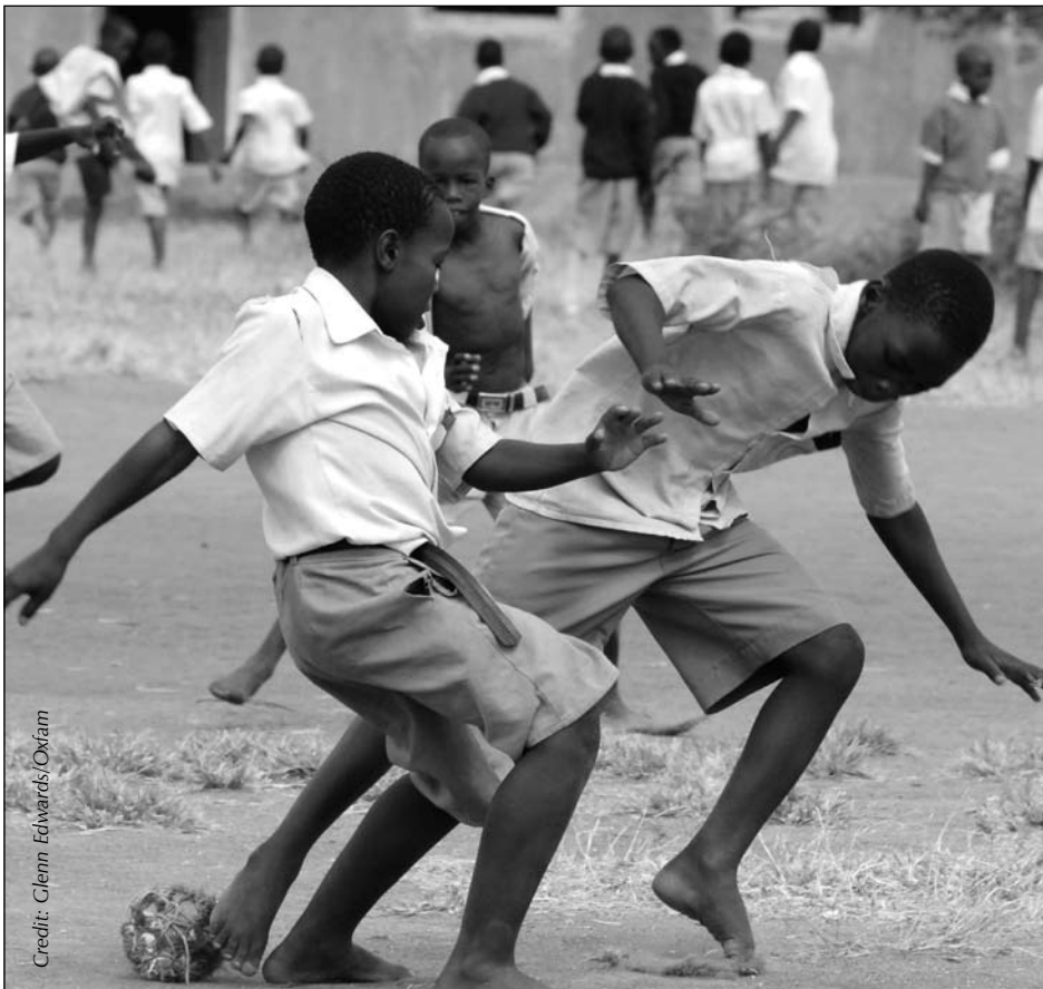
Boys playing football in Tanzania: sporting success can help boys gain friends and status at school.