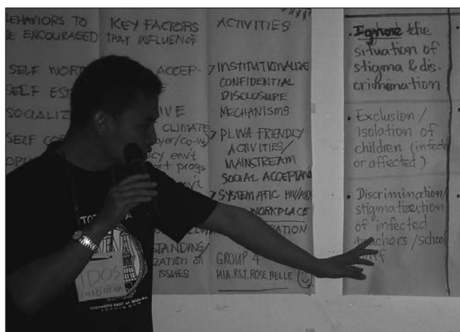
A participant at the PLWG capacity building workshop