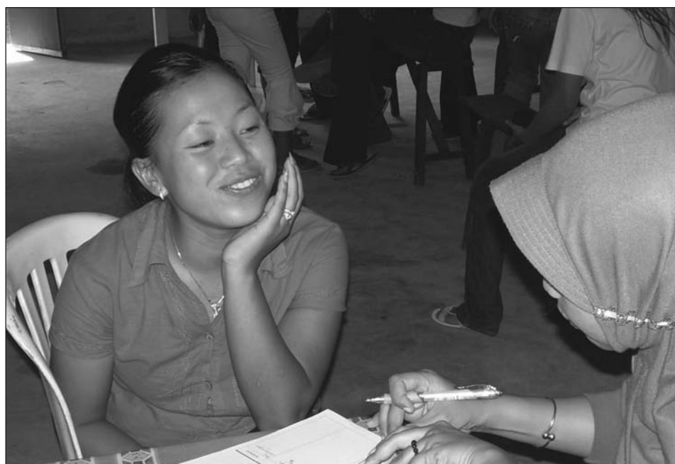
LARAS Foundation uses peer outreach to deliver integrated health and education services to sex workers

AHRN is a leading force in the region for the development of harm reduction programmes targeting drug users.