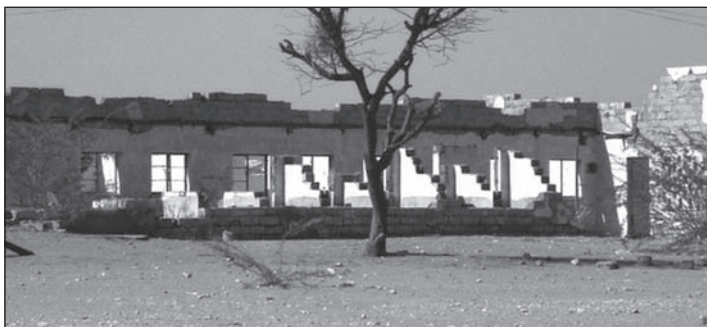
The remains of a bombed school in Somalia. Because of the conflict, education was suspended for several years.

Education plays a critical role in rebuilding societies torn apart by conflict and, as many of the countries and regions currently suffering conflict take steps towards moving into the process of reconstruction, rebuilding education systems and ensuring that they are made to