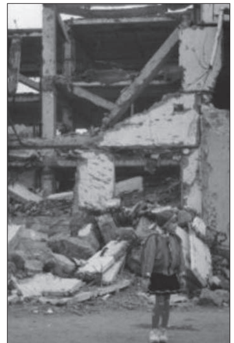
A girl stands in the remains of Middle School No. 41, Grozny, Chechnya.