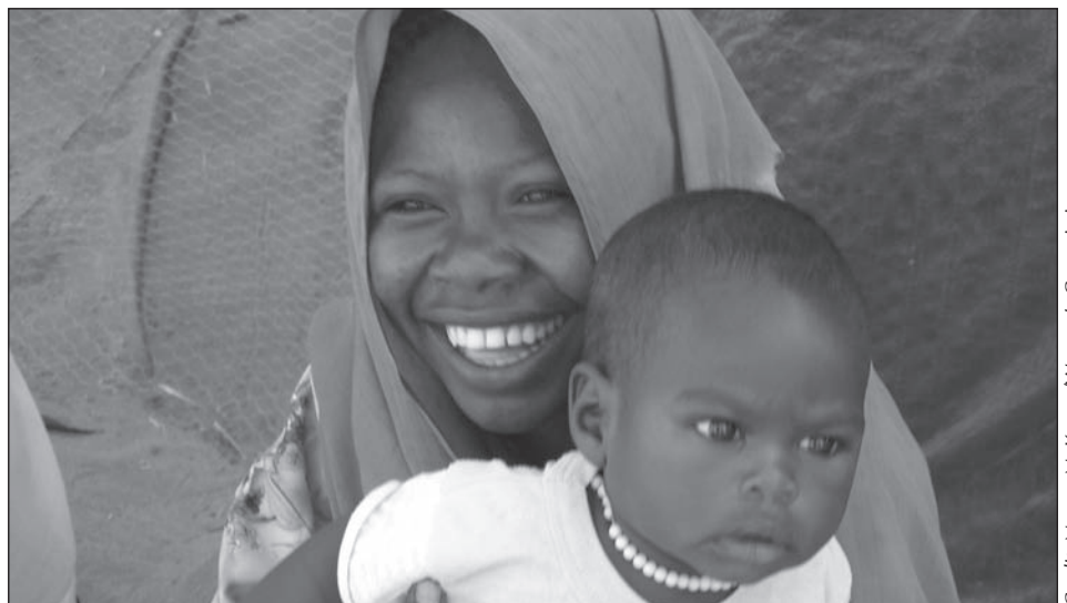
A women with her daughter in an IDP camp in Darfur.

For more information about the Women's Commission, and to access their recent report on education in the conflict to post-conflict transition in Liberia go to www.womenscommission.org/