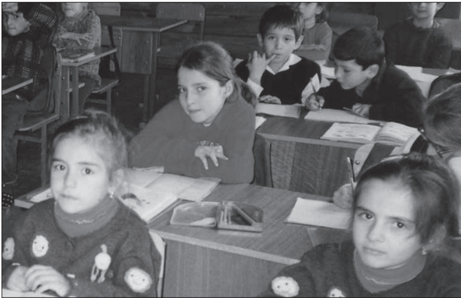
Chechen internally displaced girls and boys at school in Ingushetia.

basic education alone was sufficient for their daughters. These answers suggest that Chechen society is moving towards an acknowledgment of the importance of girls' education, whether this is a process that is just beginning, or one that is almost complete. The conflict has undoubtedly played a role in this change in attitudes.