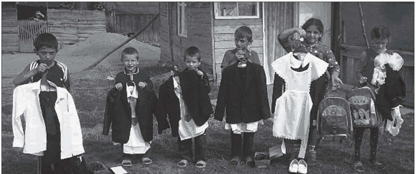
Chechen internally displaced children in Ali-Yurt, Ingushetia, hold up their school uniforms.

When asked whether girls’ education was valued by society, one woman thought that unfortunately it was not, but that Diaspora communities were “gradually coming to understand that girls’ education is essential”. In contrast, the second woman felt that only a few “backward” families still thought that