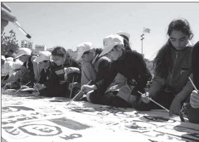
Palestinian children engaging in action learning.

For more information on the KIC project go to www.oxfam.kic.org