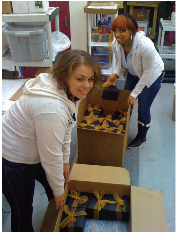
Participants in Bright Endeavors on-the-job candle making training program.

Bright Endeavors takes a highly structured approach to the job search, working with the women to determine areas of interest, identifying specific jobs and preparing them for interviews. The 18 young women who have gone through the program to date include one who Bright Endeavors connected to a selective computer training program, and who is now teaching computer classes in low-income neighborhoods. Another got a well-paying job processing credit cards for JPMorgan Chase and will be starting college in the spring working toward a degree in criminal justice.